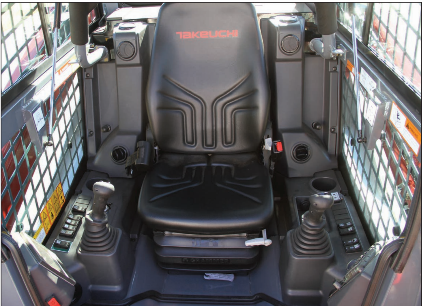
Spacious operator's station with easy to reach controls and switches.

An updated undercarriage with a wide block quiet ride track system provides better flotation, improved ride quality, and a reduction in noise and vibration. A powerful, 81.8 kW engine meets the latest EU Stage V / EPA Tier 4 emissions standards while delivering outstanding power and torque for impressive performance in the most demanding applications