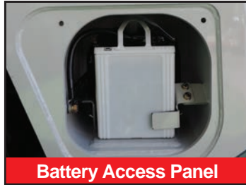
Battery Access Panel