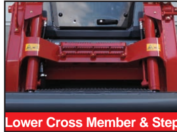
Lower Cross Member & Step