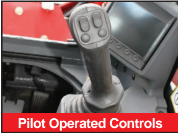
Pilot Operated Controls