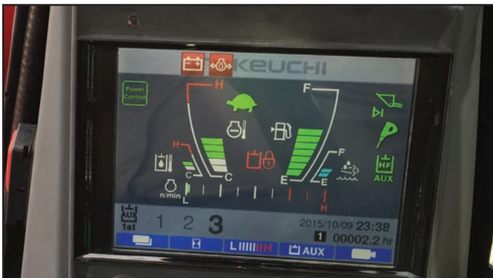
5.7" Color Display