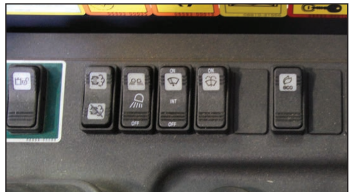
Multi-Function Switch Bank