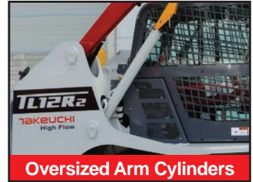
Oversized Arm Cylinders

The TL12R-2 features a radial arm loader arrangement, and demonstrates Takeuchi's continued commitment to product improvement and innovation. It features a completely redesigned operator's station with a 5.7" color multi-information display excellent feature set, and updated rocker switches that control a wide range of machine functions.